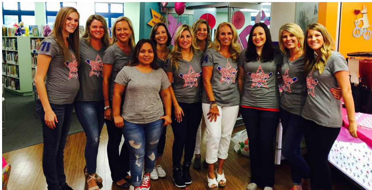
The Texas Rangers Wives hosting their Annual Pink Party and supporting Shadow Buddies!